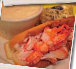
savory soups & chowders