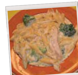
delectable pasta dishes