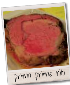
prime prime rib