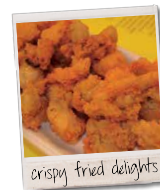
crispy fried delights

Seafood Platter 26.95 Whole clams, haddock, baby shrimp, scallops & onion rings